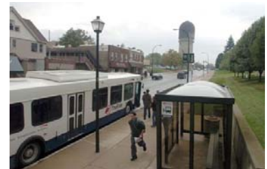
W. Cross Ave, Ypsilanti

Ypsilanti's official vote on transit funding will be on the November 2 ballot .