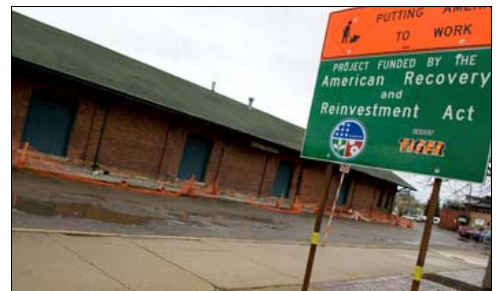
Depot Town, Ypsilanti

For a list of ARRA transportation projects in Washtenaw County, with project descriptions and anticipated completion dates, visit www.miwats.org .