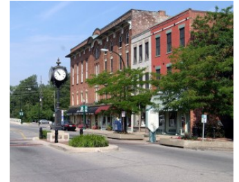
Depot Town, Ypsilanti